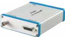
APM Analog Power Supply (Model Number: 201848) See page 57 for specs.