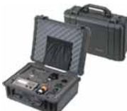
Pelican Carrying Case