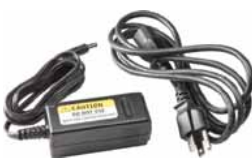
Additional 9V Power Supply (Model Number: 200960)