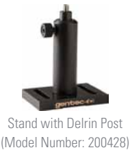
Stand with Delrin Post (Model Number: 200428)