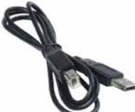
USB Cable (Model Number: 202373)